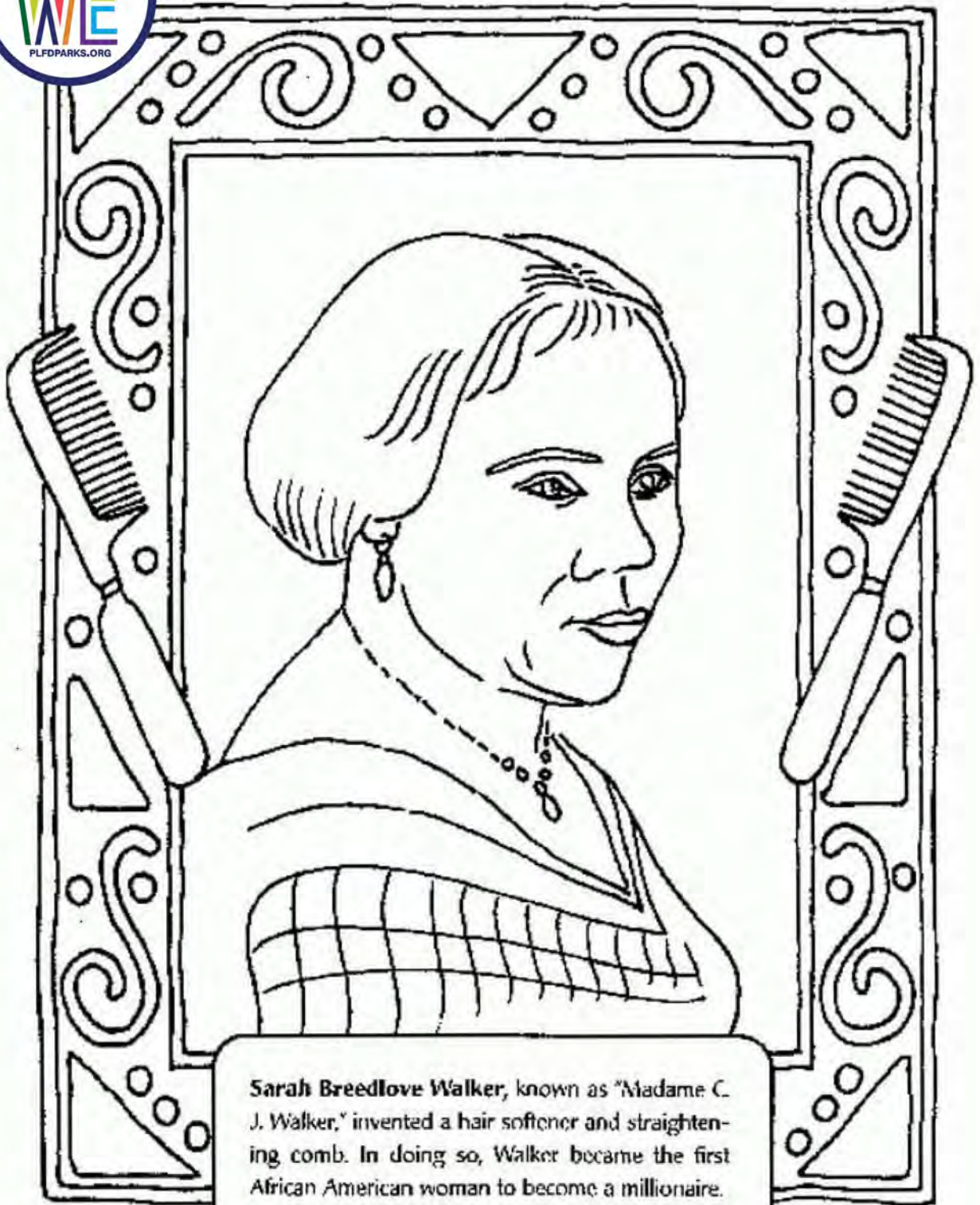
Sarah Breedlove Walker , known as "Madame C. J. Walker," invented a hair softener and straightening comb. In doing so, Walker became the first African American woman to become a millionaire.