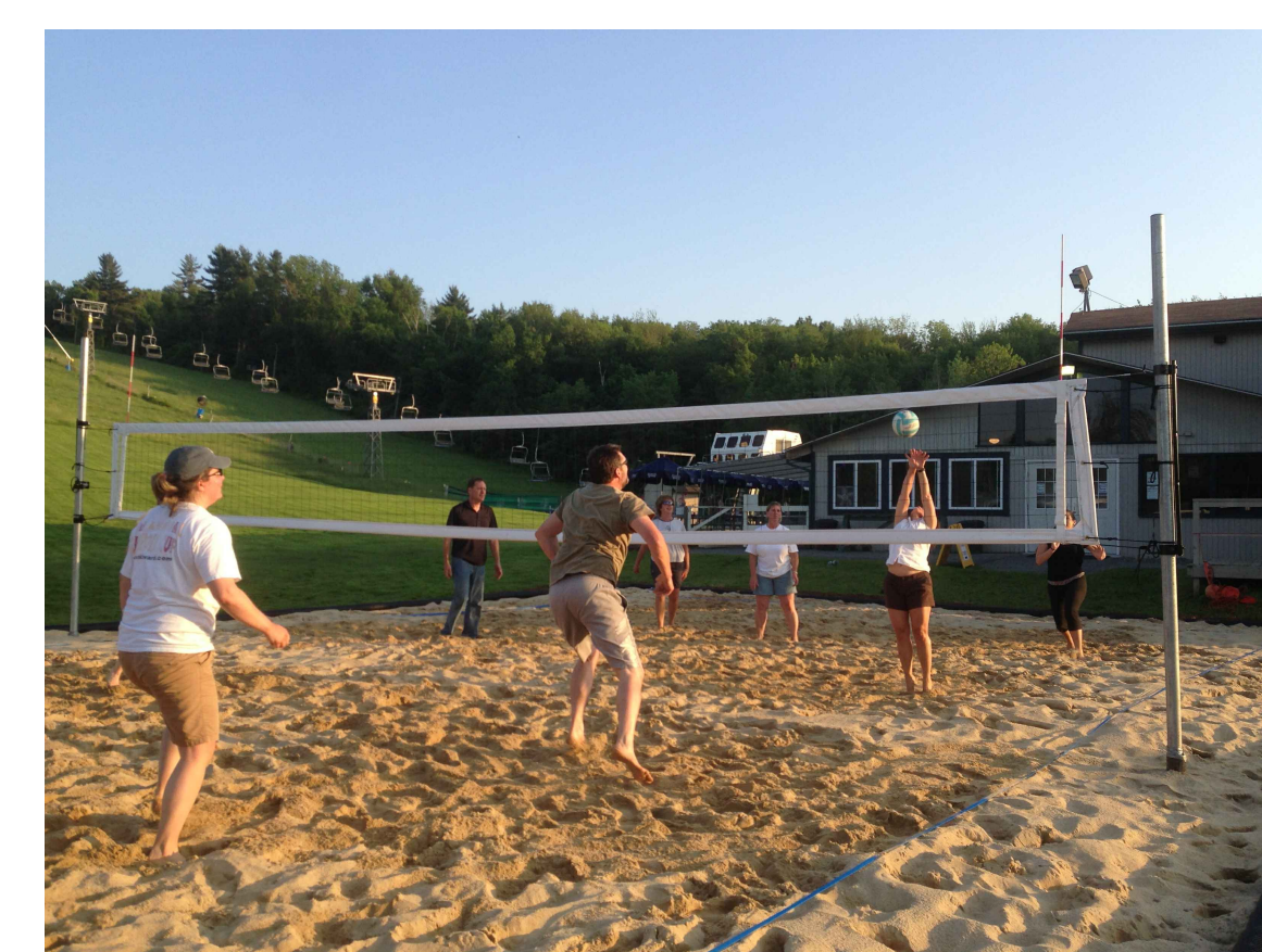
SAND VOLLEYBALL AREA