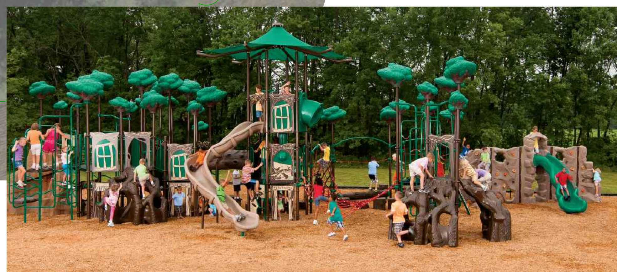
NATURE THEMED PLAYGROUND