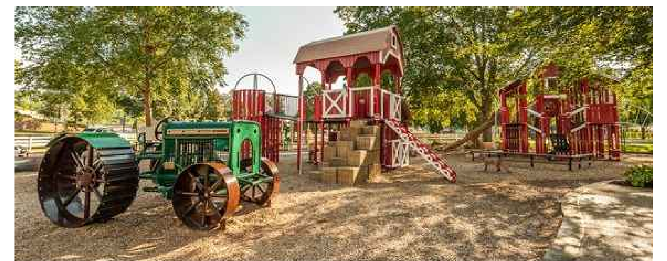
FARM THEMED PLAYGROUND