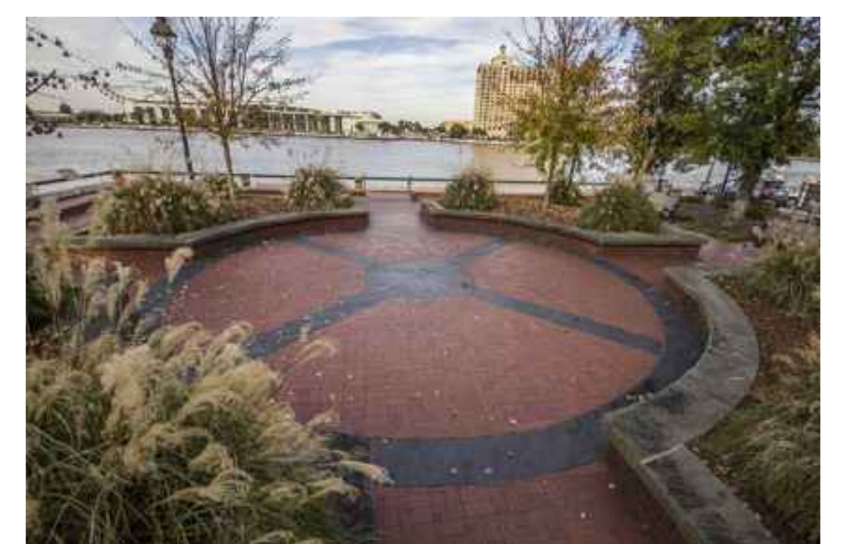
RIVER OVERLOOK PLAZA