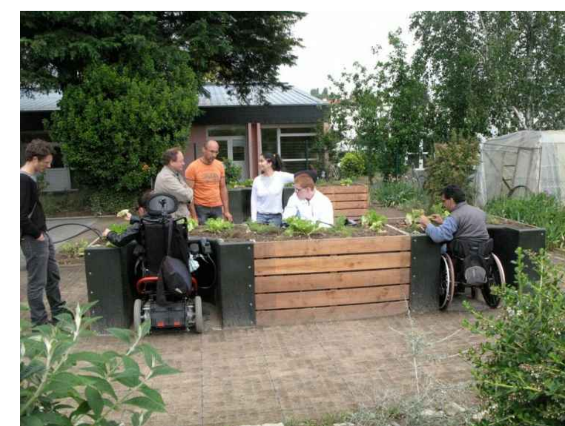
RAISED ACCESSIBLE PLANTERS