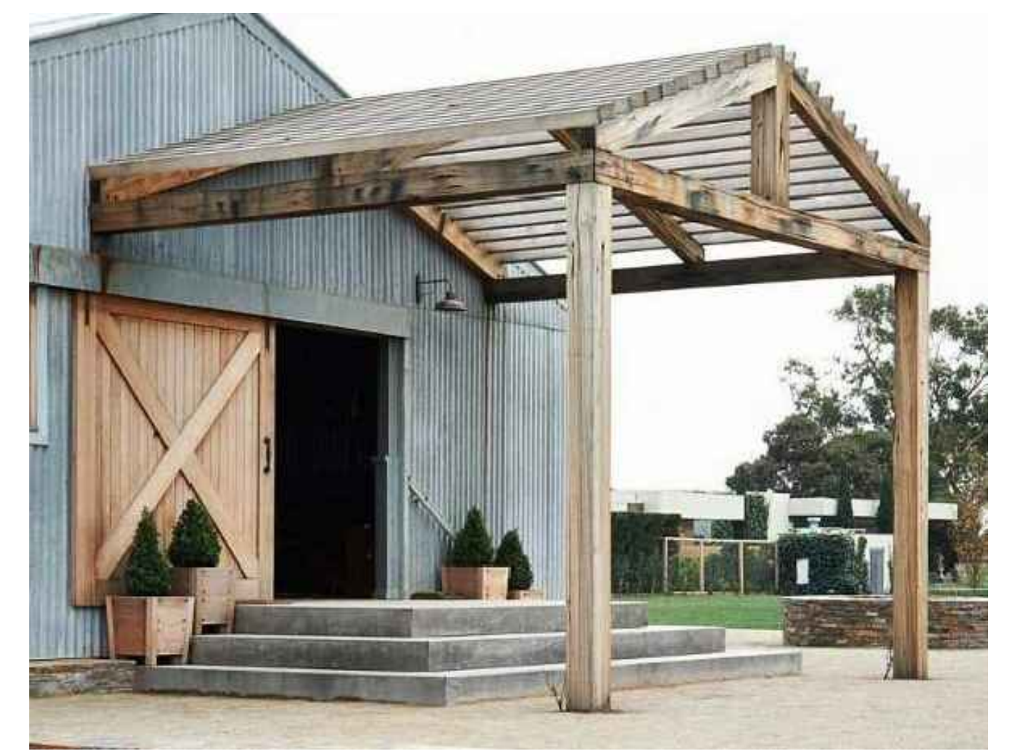
PERGOLA OVER PORTION OF OLD BARN AREA